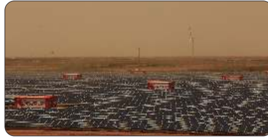
Our Completed Projects