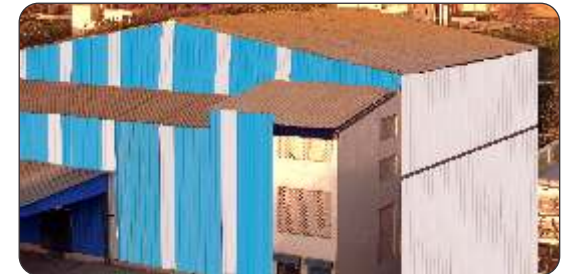
Our Completed Projects