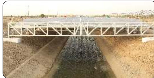
Our Completed Projects