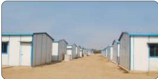
Our Completed Projects