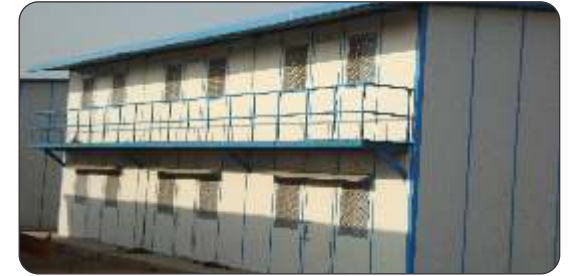
Our Completed Projects