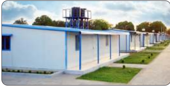
Our Completed Projects